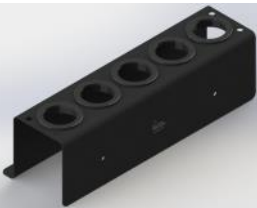
BB-9-0 Tool Holder Rack