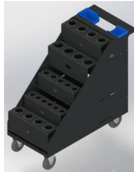
BB-15-0 Kart with 5 Tool Holder Racks Installed