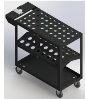
BB-3001 Kart w/ Optional DA Shelf and Locking Fixture