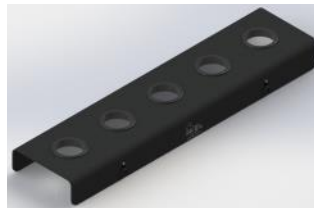
BB-9-1 Anti-Tip Shelf - Recommended for long (8"+) or nose heavy tools